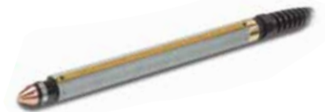
T45m machine torch