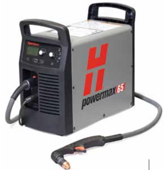
Duramax torch styles