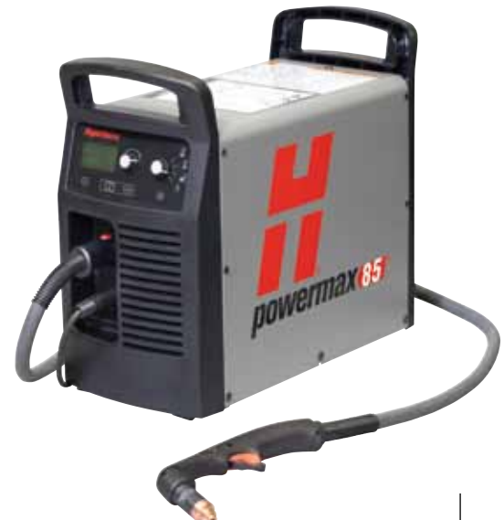
Duramax torch styles