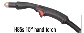
H85s 15° hand torch